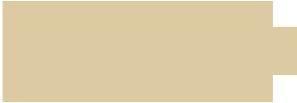
2. STONE ( Pantone+ Solid Coated - 7534 C )