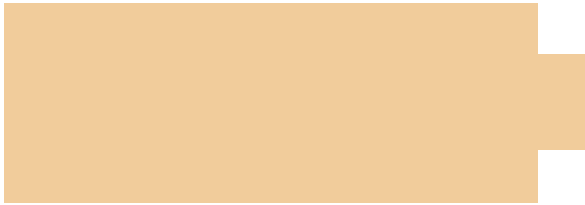
19. MEDIUM KHAKI (Pantone+ Solid Coated - 2309 C)